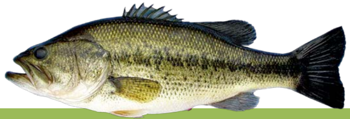
Largemouth Bass ( Micropterus salmoides )